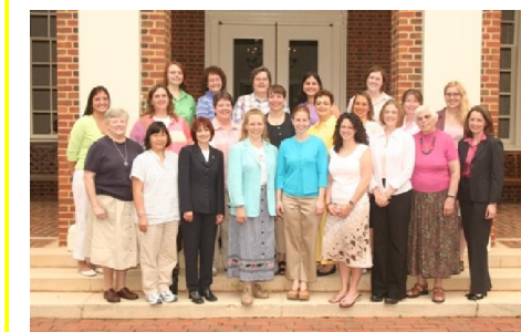
Delegates from the National Triennial Convention, held June 8-12, 2005 Sweet Briar, VA